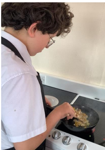
Vocational College Sessions