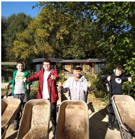
Work Based Learning