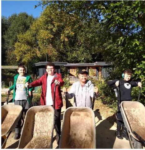
Work Based Learning