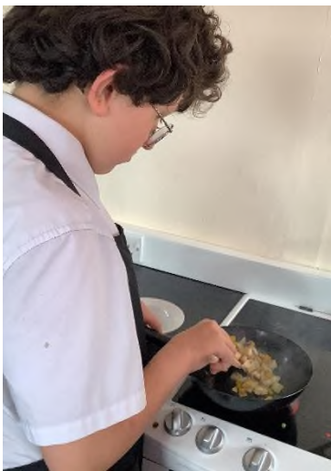
Vocational College Sessions