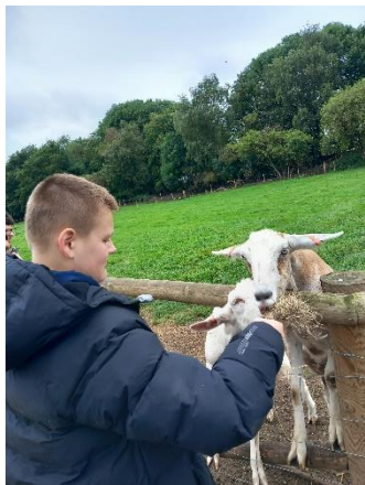
Work-Based Learning at Forge Mill Farm

This half term, students within the Secondary phase of Halesbury have had their first experience of 'Preparing for Adulthood' day where, every Thursday, students participate in a wide range of activities that have been specifically designed to support them in developing the skills that they will need as they grow up and become adults.