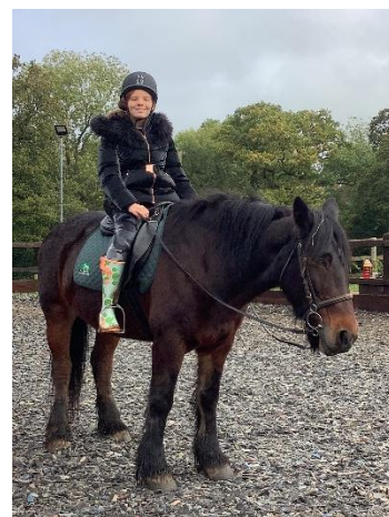
Horse-Riding Sessions at KA Equestrian Centre