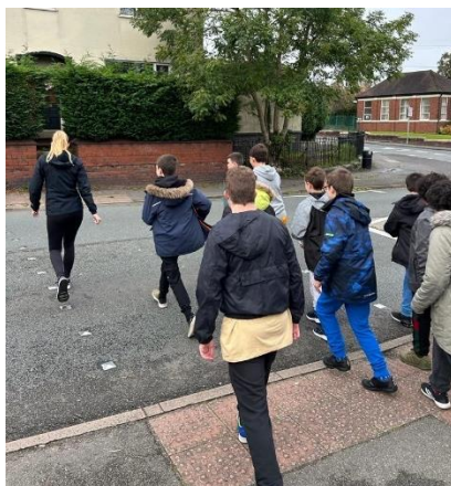
Out and About in the Community